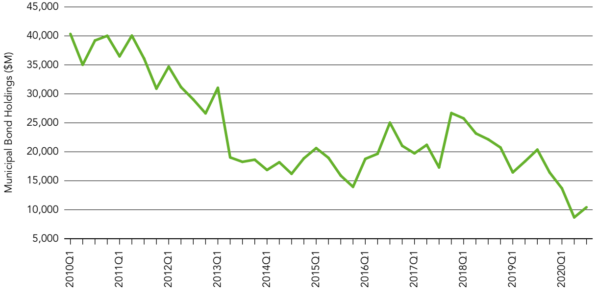
Chart 2: Municipal Bond Holdings by Broker-Dealers, Q1 2010–Q3 2020