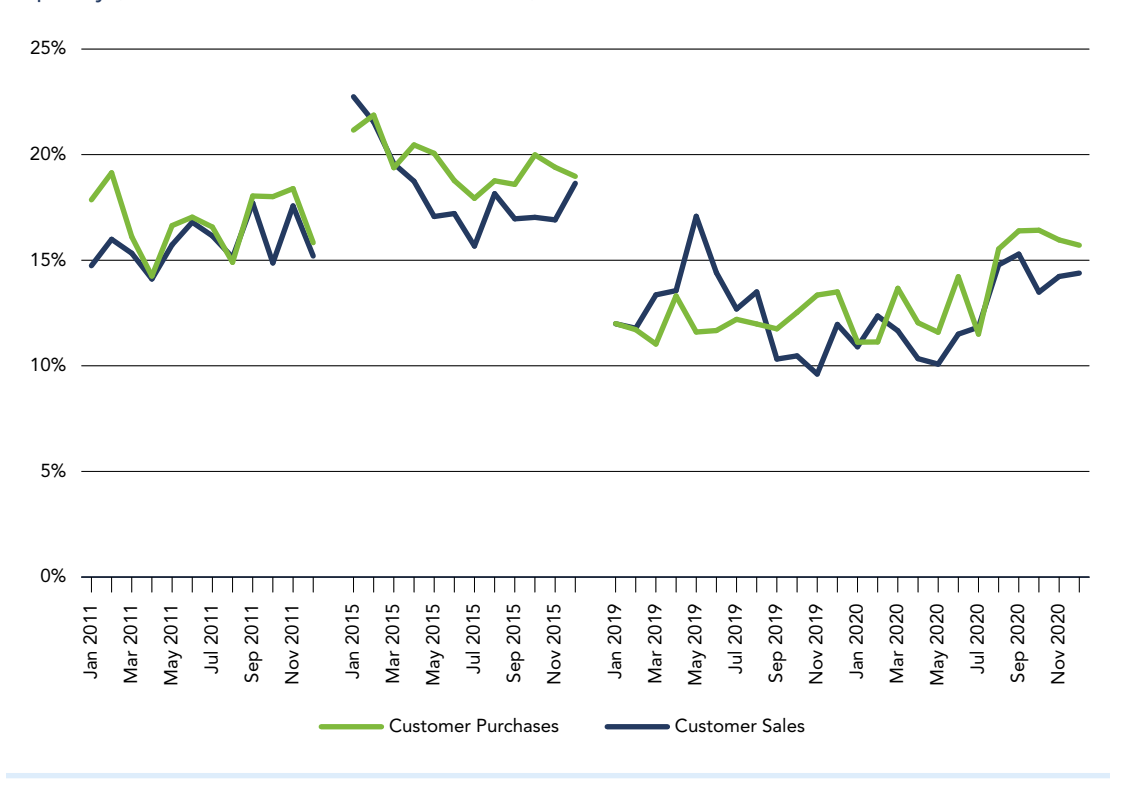
Figure 7. Difference Between Customer Purchases and Customer Sales Using External Liquidity (Transactions of $1 Million or More)