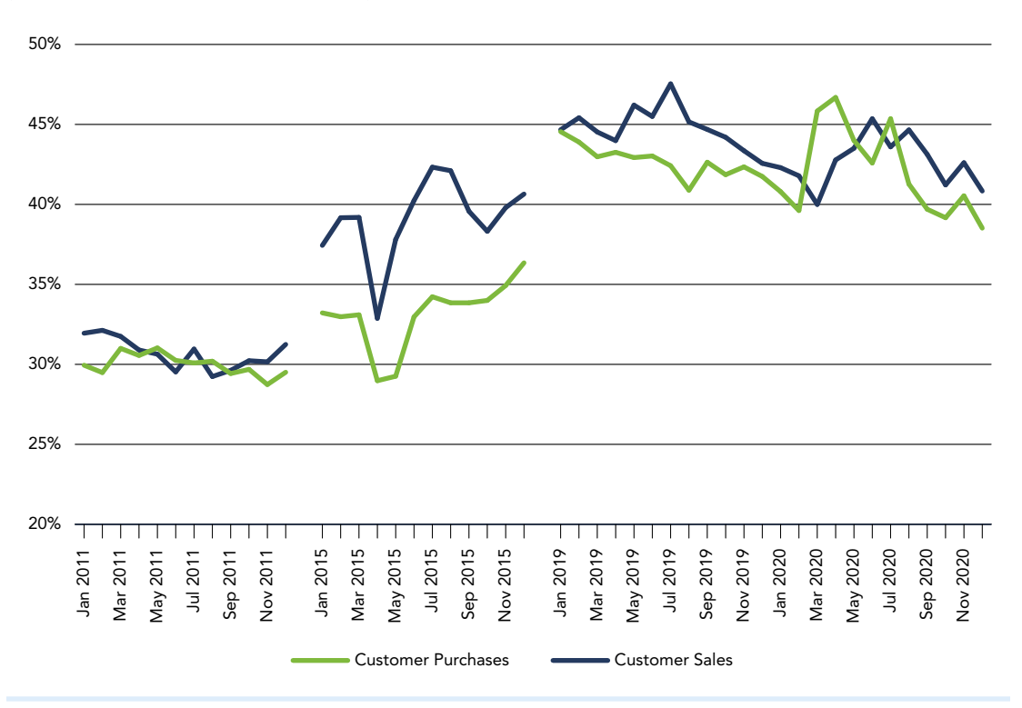
Figure 5. Comparison of Customer Purchases and Customer Sales Using External Liquidity (Transactions of $100,000 or Less)

The use of external liquidity for customer purchases of $1 million or more accounted for 16.9% of all customer purchases in 2011. That level increased to 19.6% in 2015 before decreasing to 12.2% in 2019 and increasing again to 13.7% in 2020, as shown in Figures 6 and 7. For customer sales of the same size, a similar pattern occurred: an increase from 2011 to 2015 before decreasing in 2019 and 2020.